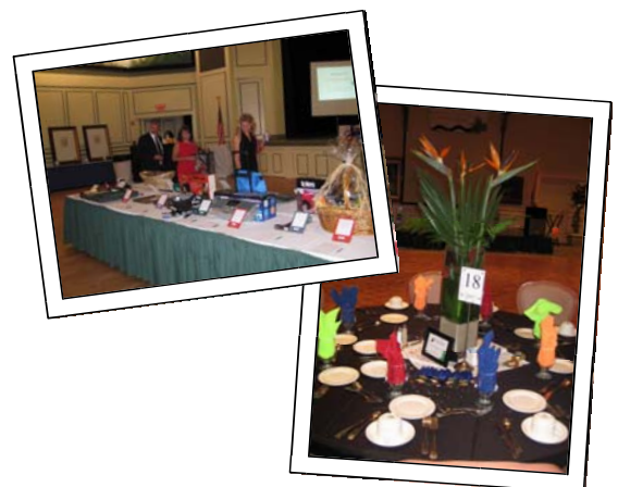
Below Right: Bright colors and tropical flowers helped set the festive atmosphere.