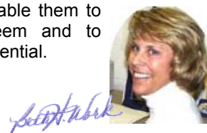
Chief Professional Officer

Finally, Sports, Fitness and Recreation develops fitness, positive use of leisure time, skills for stress management, appreciation for the environment and social skills. Through these five core program areas, our members become engaged in activities with adults, peers and family members that enable them to develop self-esteem and to reach their full potential.