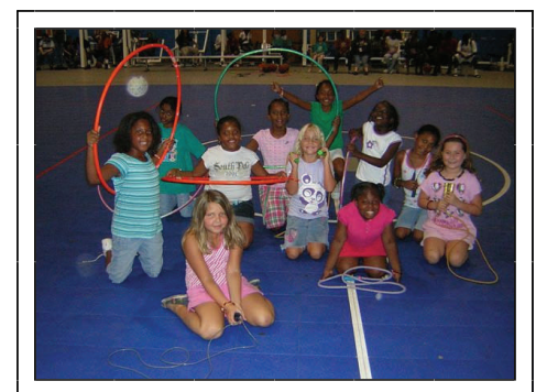
A group of girls taking a break from Triple Play Day at the Teeter Unit during the last week of summer. The Triple Play program is designed to improve Club members' knowledge of healthy habits, good nutrition, and fitness.

Thank you to everyone who helped make the 2009 Summer Program possible!